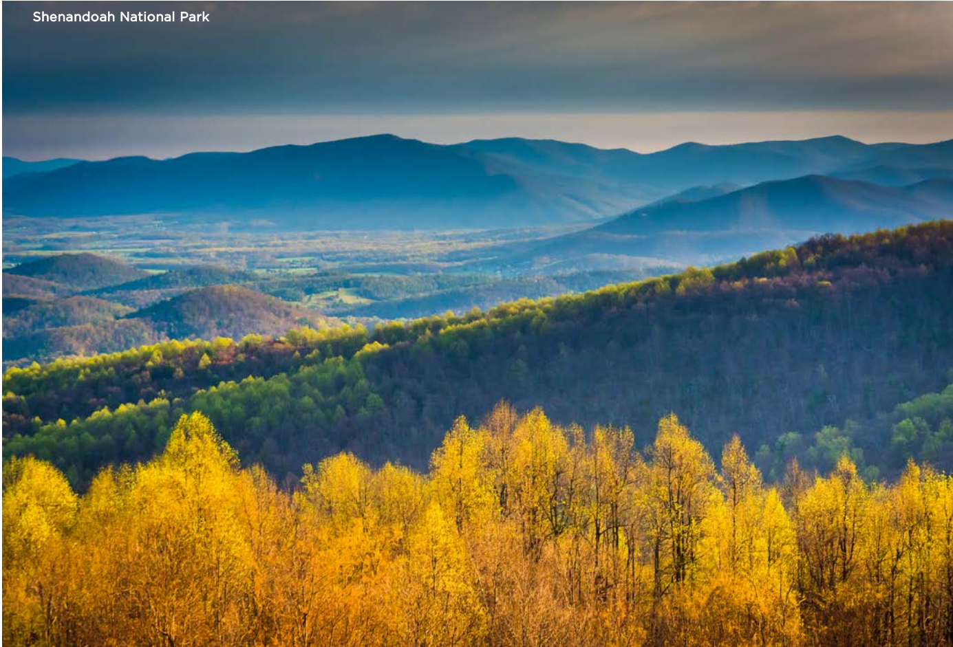
Shenandoah National Park