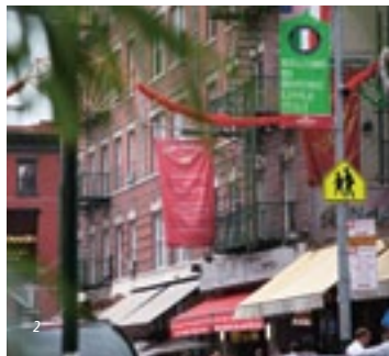
1 · Chinatown / 2 · Little Italy