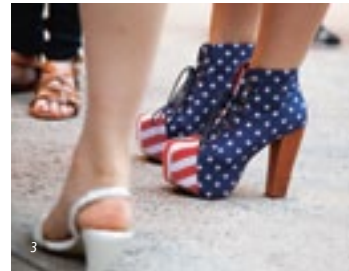
1 - Bloomingdale's 2 - Exclusive boutique 3 - New York style 4 - Fashion show