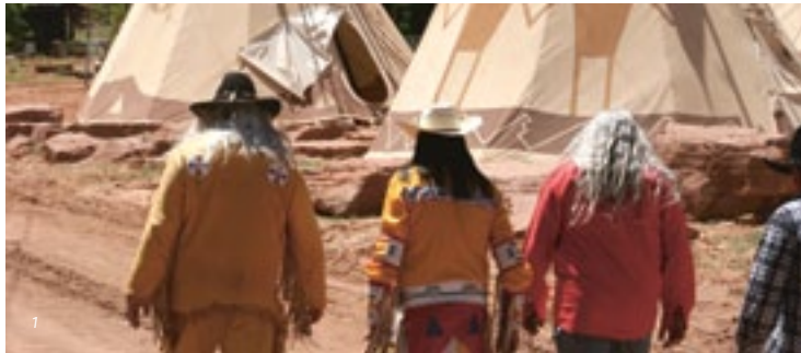
1 - Native Americans

size, picturesque Indian villages. Come experience how Native Americans lived and conducted their lives.