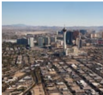
1 · Hot Air balloons / 2 · Las Vegas skyline